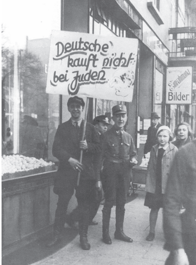
SA soldier near a Jewish-owned store on the day of the boycott, Germany. Yad Vashem Photo Archive (1652/11)